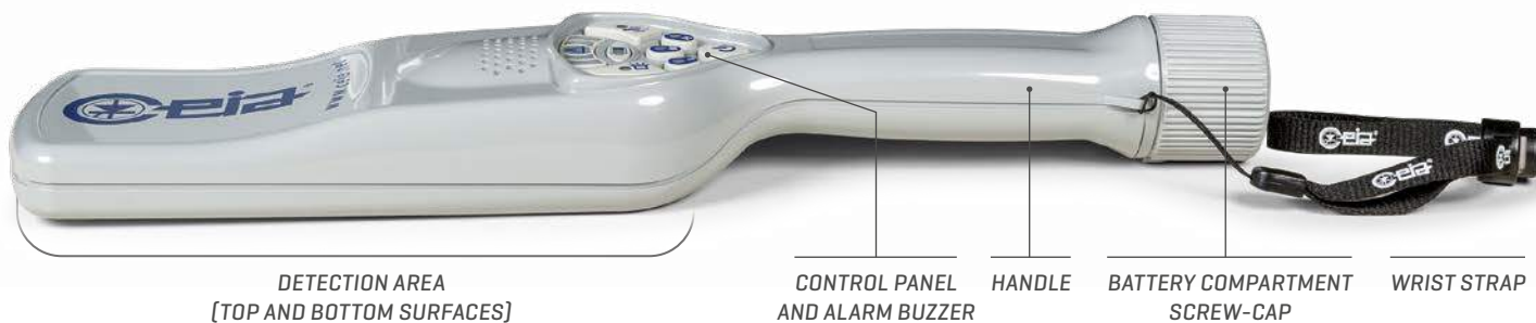
DETECTION AREA [TOP AND BOTTOM SURFACES]