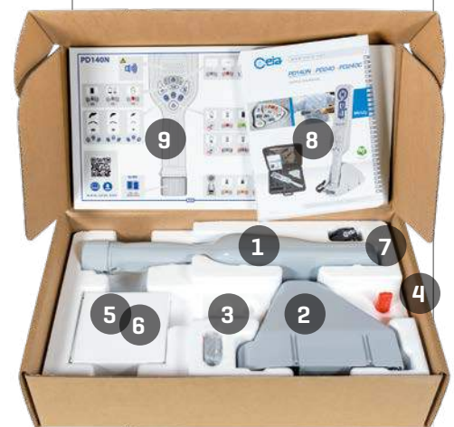
PD140N [# PD140N-SET]